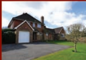
WARNINGLID 6 bed detached house £835,000