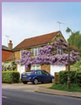
David Tingley Wisteria in full bloom in Cuckfield