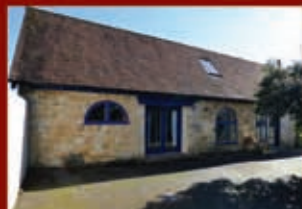
CUCKFIELD 2 bed attached barn £255,000

For more information about any of the above properties for sale or to arrange a free valuation please call Richard Butler on 01444 417600 or email us at cf@mansellmctaggart.co.uk