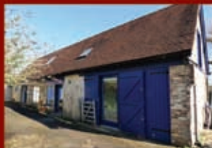
CUCKFIELD 2 bed attached barn £300,000