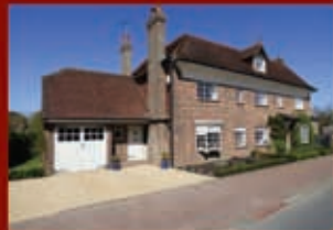
CUCKFIELD 4 bed semi-detached cottage £750,000