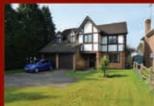
BOLNEY 5 bed detached house £724,950