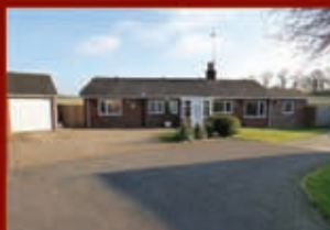
BOLNEY 3 bed detached bungalow £599,950