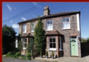
CUCKFIELD 3 bed semi detached cottage £410,000