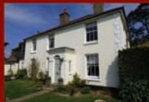
HANDCROSS 3 bed semi detached Cottage £385,000