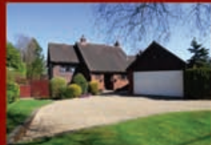
WARNINGLID 5 bed detached house £750,000

A selection of properties currently for sale in and around the village