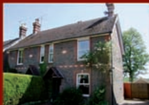
ANSTY 3 bed semi-detached £359,950