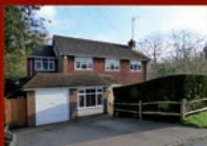
BOLNEY 5 bed detached house £649,950