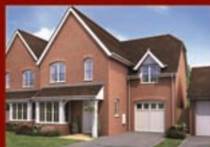
CUCKFIELD 4 bed detached £500,000