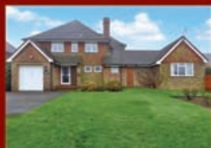
WARNINGLID 5 bed detached house £895,000

A selection of properties currently for sale in and around the village