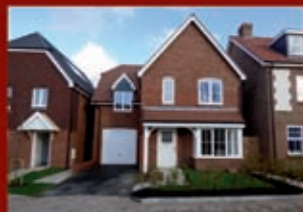
CUCKFIELD 4 bed detached £490,000