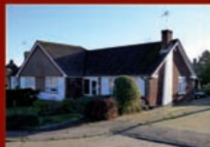
CUCKFIELD 2 bed semi-detached bungalow £350,000

For more information about any of the above properties for sale or to arrange a free valuation please call Richard Butler on 01444 417600 or email us at cf@mansellmctaggart.co.uk