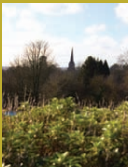
Holy Trinity Church from Warden Park