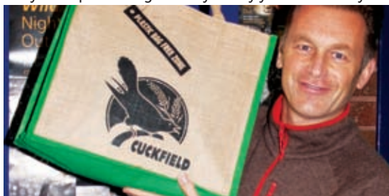
Naturalist Chris Packham with a Cuckfield reusable bag