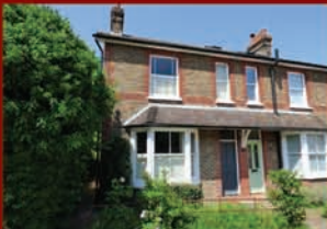
CUCKFIELD 3 bed semi detached £499,950