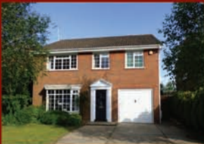
CUCKFIELD 4 bed detached house £624,950