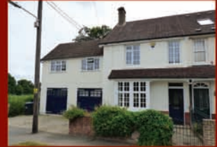
CUCKFIELD 4 semi detached house £595,000