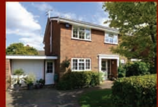
CUCKFIELD 4 bed detached house £519,950