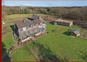
CUCKFIELD 4 bed detached house £800,000