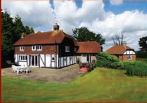
CUCKFIELD 5 bed detached house £1,200,000

A selection of properties currently for sale in and around the village