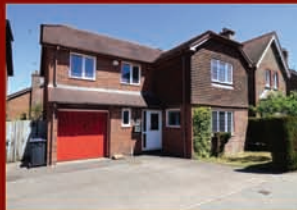
CUCKFIELD 4 bed detached house £524,950