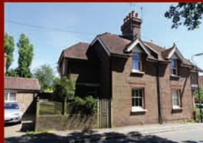
CUCKFIELD 3 bed detached house £315,000