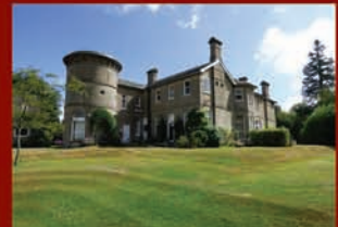
CUCKFIELD 1 bed retirement flat £190,000